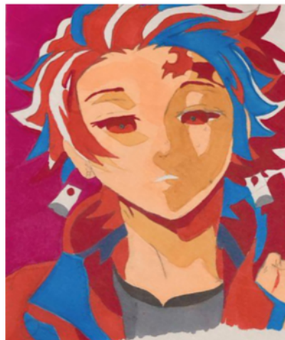
Ravi Gothi Batch'22