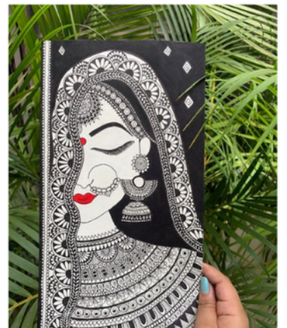
Aashvi Agrawal Batch'23 Division A