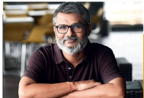
Mr. Nitesh Tiwari

His latest direction, Chhichhore, was a "self-realization exercise" for him. Tiwari drew heavily from his own life to shape the plot and characters of the film - he had started struggling with the idea of being a 'loser' in '91, when he failed his first attempt to clear IITJEE. While he passed the entrance exam in the following year, a lot of his friends didn't, despite numerous attempts. He disclosed that dealing with that failure is hard and that the episode scarred his friends, because nobody told them that eventually, things will fall into place. Chhichhore went on to win the National Film Award for Best Feature Film in Hindi in 2020, and this was possible only because of Tiwari's constant itch to tell heart-touching stories and showcase human emotions through films.