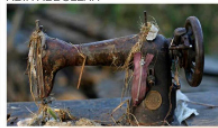
Sewing Machine A damaged sewing machine after the cyclone hit, Amtali, Patuakhali, Bangladesh 19 November 2007.

The senior batch was given a wide range of topics to write a story- from images to quotes to statements, the possibilities were endless. Students would then select 1 of these topics/concepts or pictures and formulate an entire narrative around it. Through these stories we were transported to all parts of the world, different situations, tastes, weather, and more. It allowed our imagination to run wild and liberalized our minds.